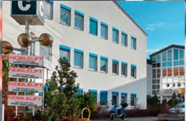
Noblelift Europe GmbH

Practical and efficient training. Safe and easy handling of our products. That's why we hold seminars in our competence centre or on site with our dealers and customers. Our goal is to make it as easy as possible to use our products. In the seminars, the theory taught is immediately tested on an extensive range of equipment. "Learning by doing" provides a deep insight into the entire world of materials handling technology.